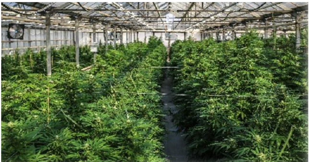
Exhibit 1: Cannabis plants growing at the company's outdoor greenhouse in Prague

MGC acquired 80% of Panax Pharma (Panax) in February 2017 in exchange for a commitment to fund the first year of operations, capped at €0.7m. MGC has an option to acquire the remaining 20% of Panax for €0.6m of shares in MGC. Panax has a strategic partnership with the Institute of Experimental Botany at the Academy of Sciences of the Czech Republic (IEB) in Prague, which holds a medical cannabis breeding licence and provides access to 1,100m 2 of dedicated greenhouse growing space.